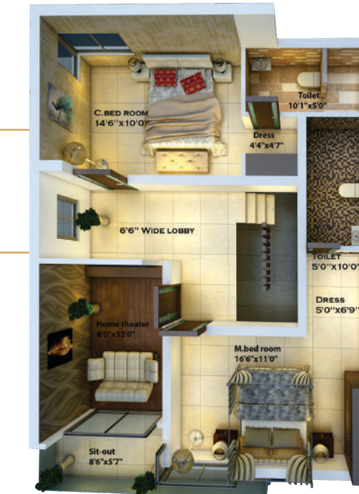
FIRST FLOOR AREA