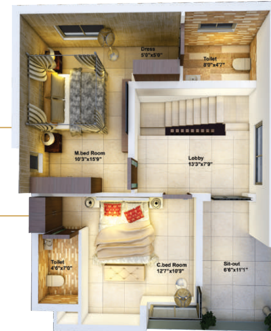
FIRST FLOOR AREA