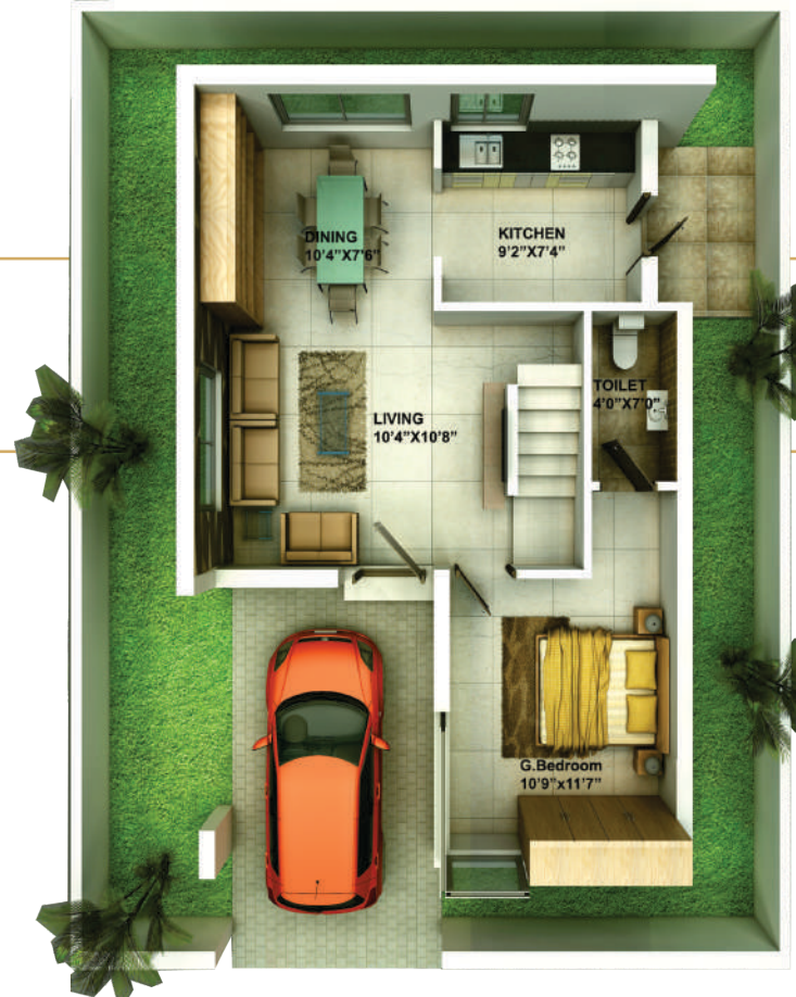
GROUND FLOOR AREA