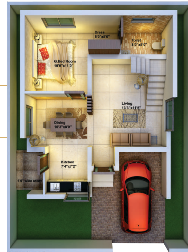
GROUND FLOOR AREA