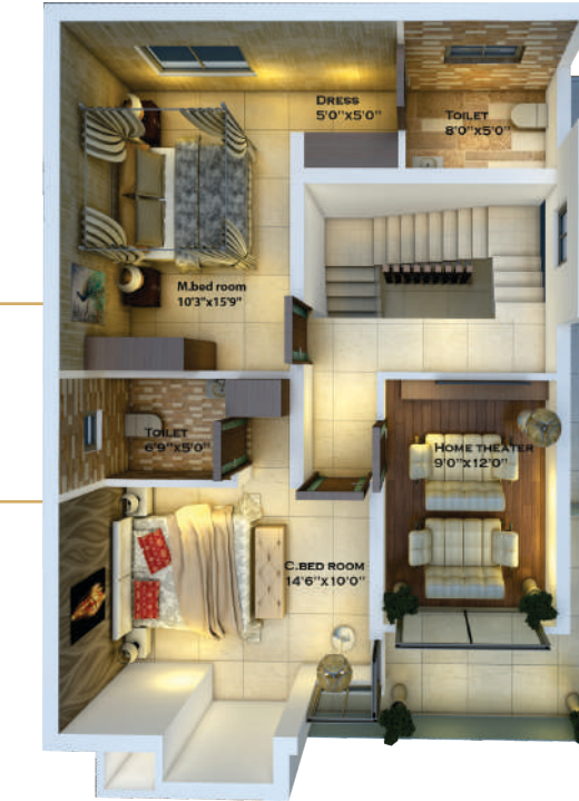
FIRST FLOOR AREA