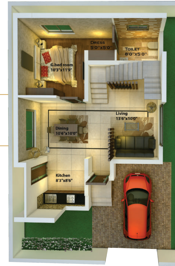
GROUND FLOOR AREA