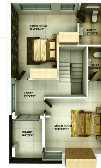
FIRST FLOOR AREA