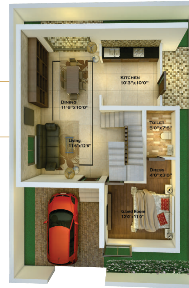
GROUND FLOOR AREA