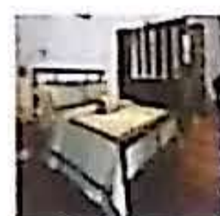
Wooden Floor for Master Bedroom