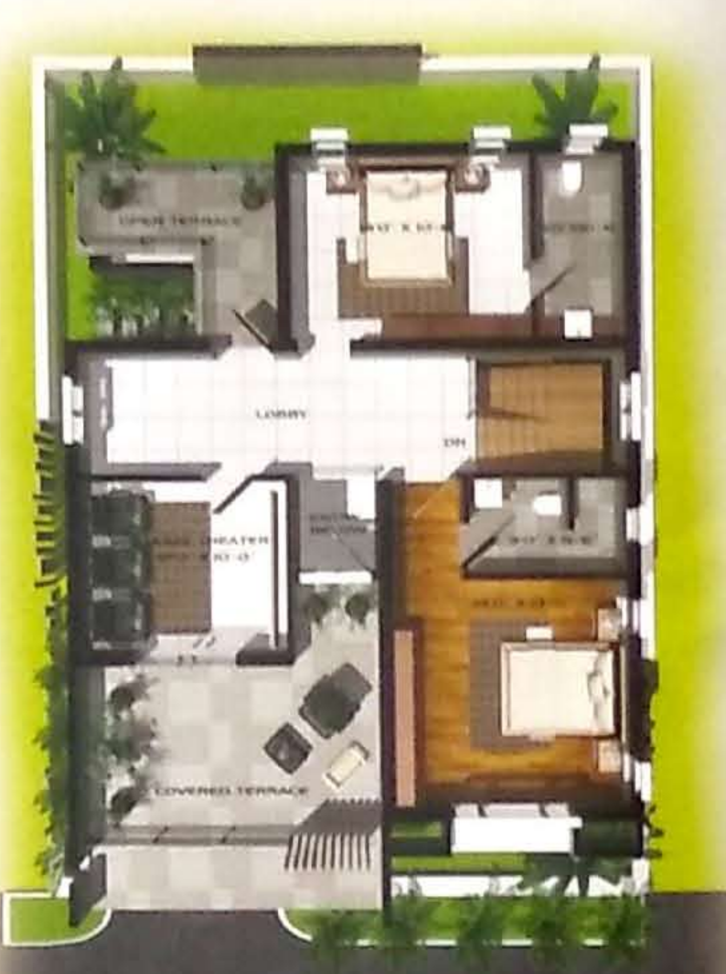
FIRST FLOOR PLAN Construction Area: 1315 Sq. ft.