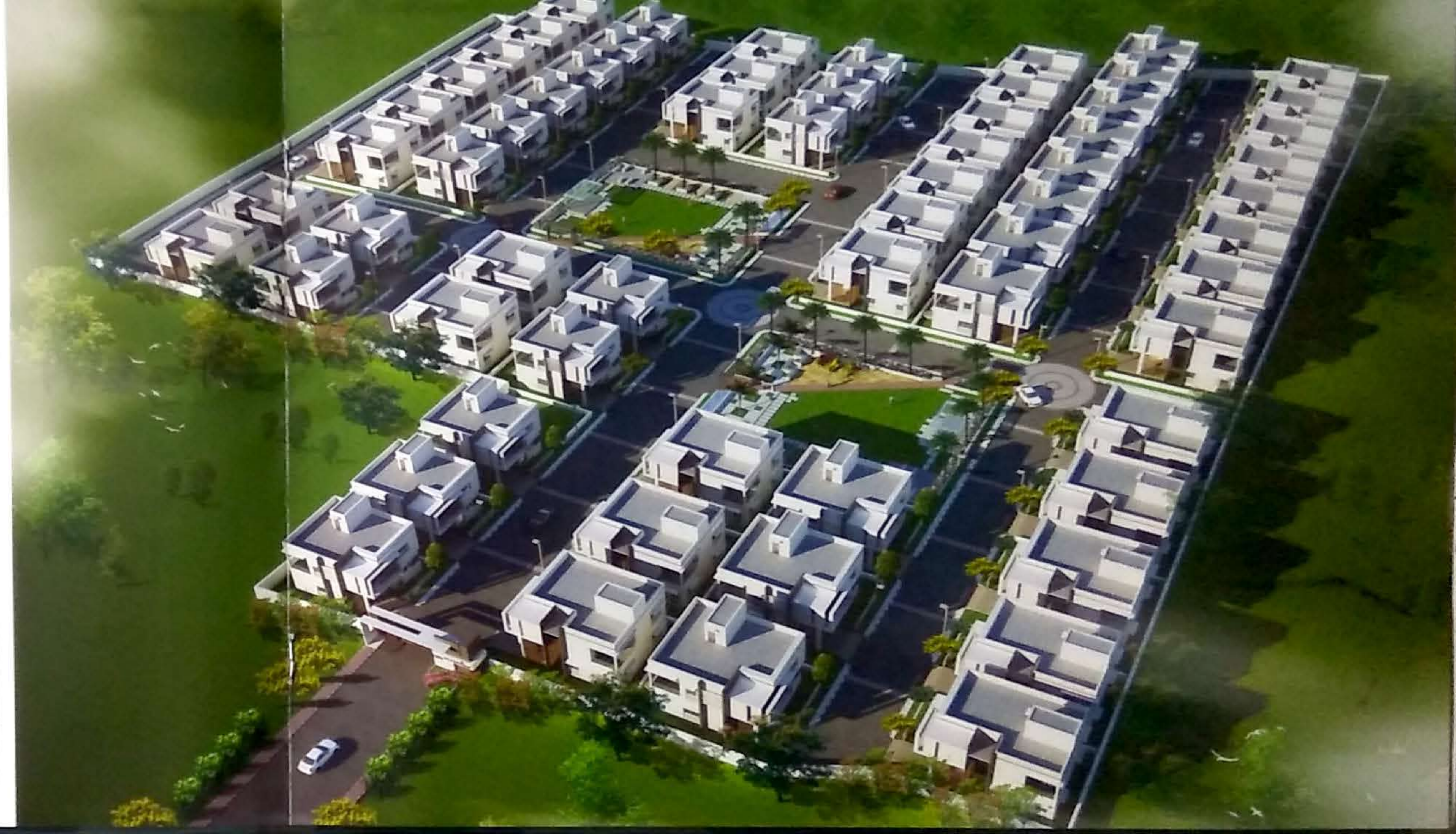
Rendered bird view of Purple Leaf