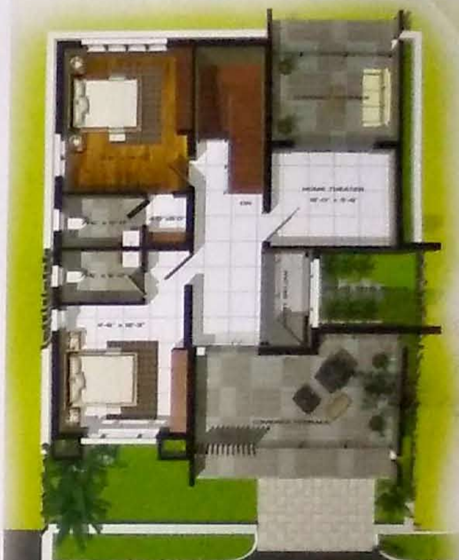
FIRST FLOOR PLAN Construction Area: 1295sq.ft