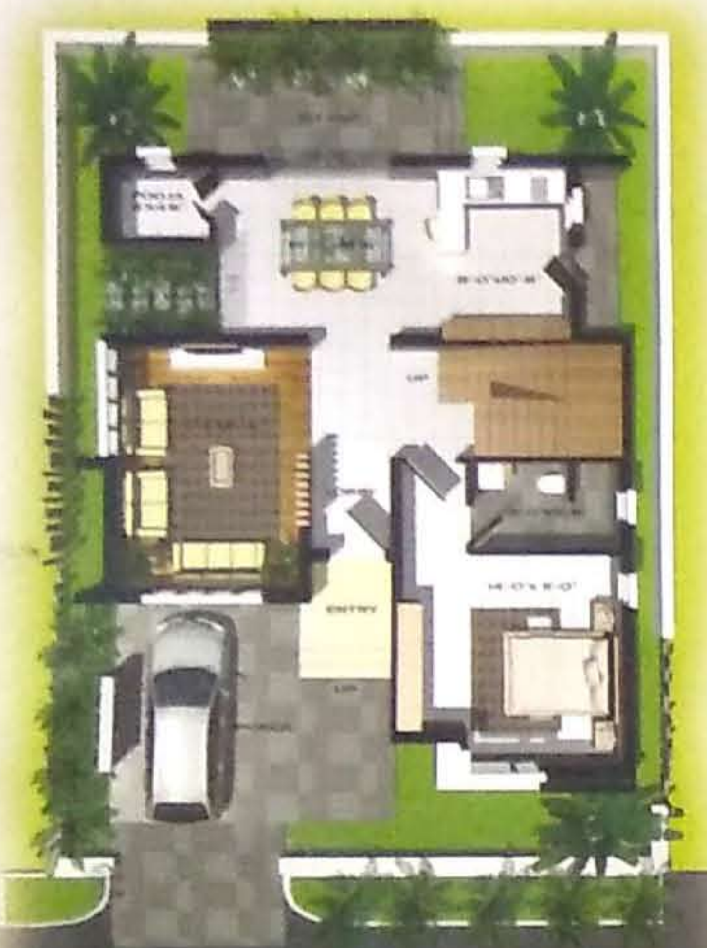
GROUND FLOOR PLAN Construction Area: 1315 Sq. ft.