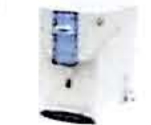
Water RO System