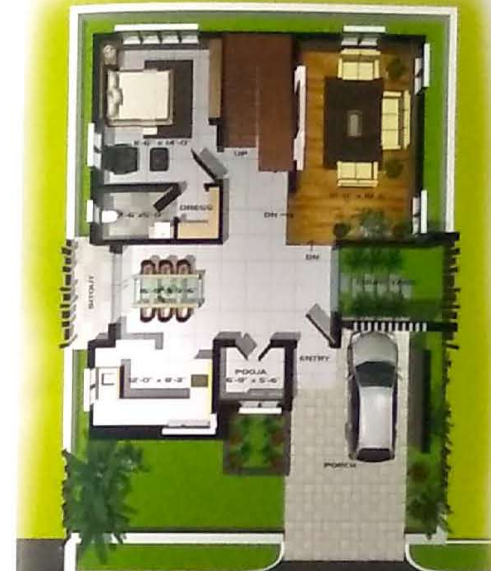
GROUND FLOOR PLAN Construction Area: 1295sq.ft