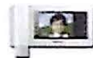
Video Door Phone